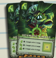
2★ Hexmatic Aimbot