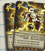
2* Chain Lightning