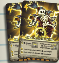
2+ Chain Lightning