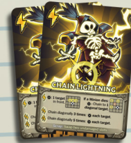
2* Chain Lightning