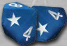
MARINE DICE x4

These ten sided dice (D10) are identical to those found in the Another Glorious Day In The Corps box.