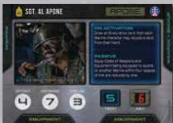
CHARACTER CARDS x6