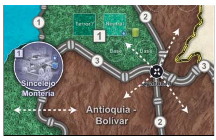
ADJACENCY EXAMPLE: The 4 Departments and 4 LoCs around the Town of Ayacucho are all adjacent to each other because they are separated by a Town. Antioquia and the Forest Department to the west are adjacent because they are separated by a LoC.

1.3.7 Coasts. Spaces adjacent to blue areas are coastal, affecting the "Narco-Subs" Event.