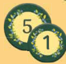
Victory Point tokens