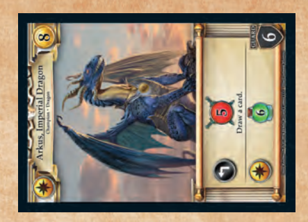
Example of a champion after using its expend ability

Expend abilities are indicated by in the text box. To use this ability, turn the card sideways. You can use the Expend Ability of cards at any point during your Main Phase, including the turn you play the card with an Expend Ability.