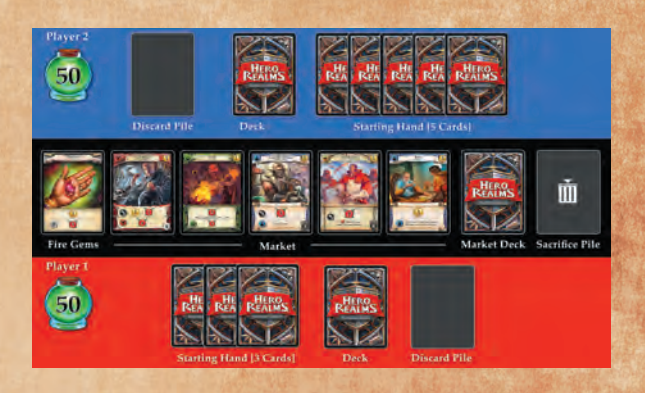
Beginning of game layout. Player 1 is going first.

Randomly determine which player goes first. That player draws three cards (players always draw from their own personal deck). The player going second draws five cards.