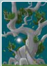
6 Trunk cards