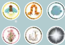
12 Player tokens (2 for each icon)