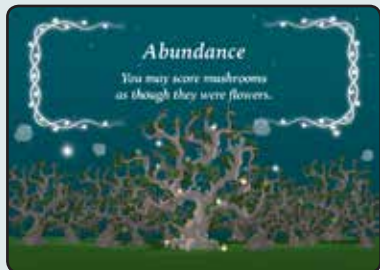
Revealed Decree card for Spring season