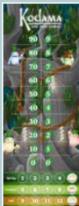
1 Score track