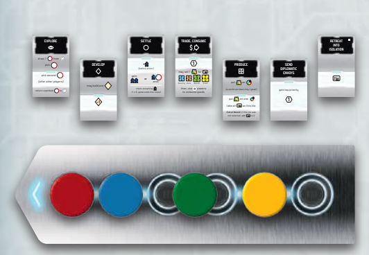
Third Action, selected by Green and done in order by Green, Yellow, Red, and Blue.