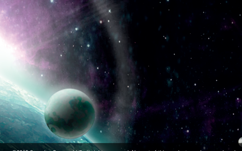
©2015 Gamelyn Games, LLC all rights reserved. No part of this product may be reproduced without specific permission. Tiny Epic Galaxies, Gamelyn Games, and the TEG logo are trademarks of Gamelyn Games, LLC.

Additionally, everyone involved with Tiny Epic Galaxies thanks the 12,458 Kickstarter backers that made this game a reality! The Tiny Epic community is, by far, the best and most creative bunch of folks on Kickstarter!