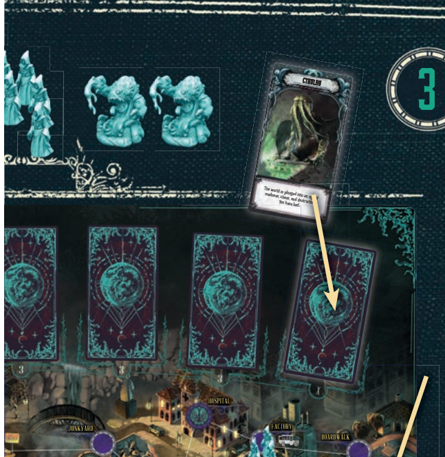
PLACE CULTISTS AND SHOGGOT

Shuffle all Summoning cards together and place them in the space provided as the Summoning deck.