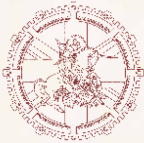
“Knights of Saint-George” Club

The “Knights of Saint-George”, said to be to oldest club in London, is composed exclusively of retired soldiers who share a belief in traditional definitions of valor and an extreme loyalty to the crown.