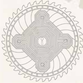
“The Maze” Club

Uncanny entities and events abound in London—some stranger than others—and the effects of their passing show like scars on the city. Few give much thought to the damaged and abandoned buildings, even the post office of Saint Pancras. Fewer still suspect that this ruin plays host each week the meetings of the “Maze”, a club restricted to people who can speak to ghosts. With great discretion, its members share what they have learned from the dead. They seek a truth that most mortals cannot grasp, but most are mediums of mediocre skill. None of them, or anyone else, knows that among their number walks Sir Daniel Home, the greatest medium alive.