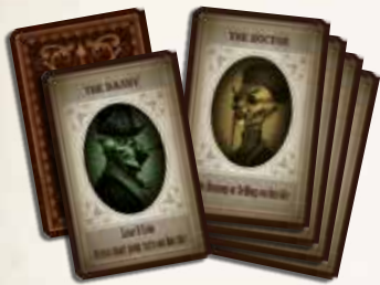
6 AGENT CARDS