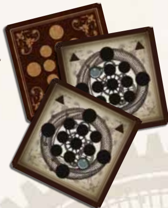
13 SECRET COMBINATION CARDS