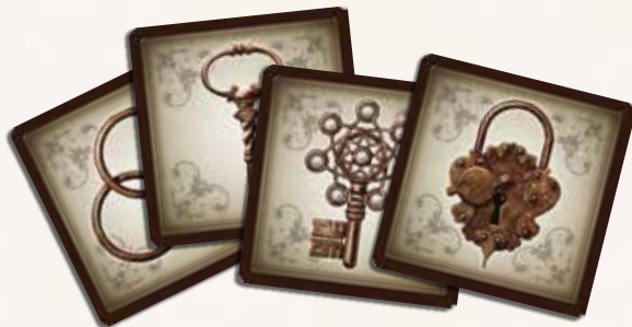
16 ARTEFACT CARDS (4 OF EACH TYPE)