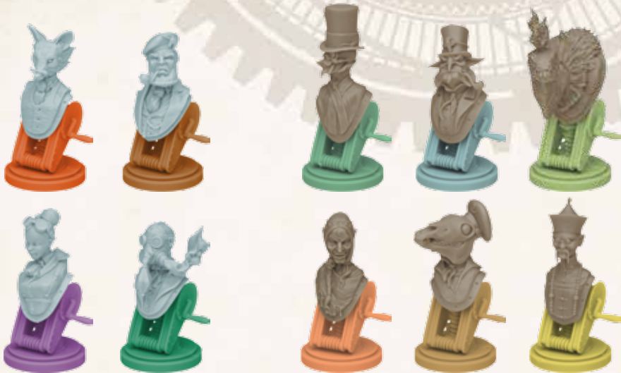
4 GENTLEMAN FIGURES