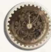
1 FIRST PLAYER/ SHADOW MASTER TOKEN