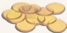
16 ETHER COUNTERS