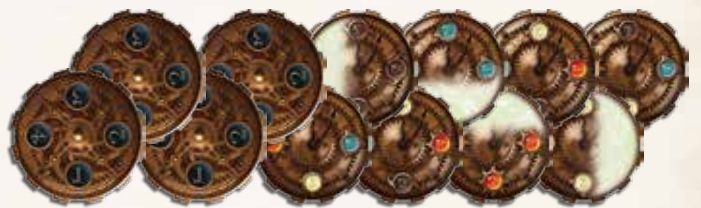
12 LOCATION TILES