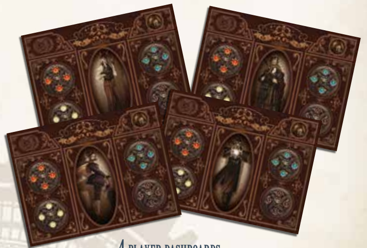
4 PLAYER DASHBOARDS