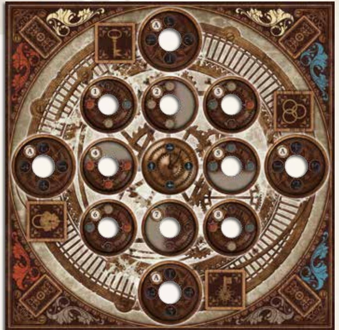
1 GAME BOARD