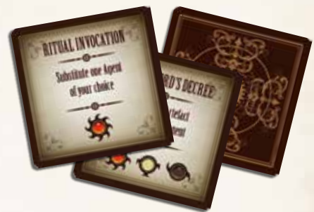
24 SPECIAL ACTION CARDS