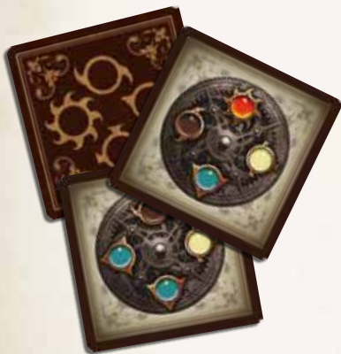
8 SECRET GATE CARDS