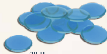
30 HOURGLASS TOKENS