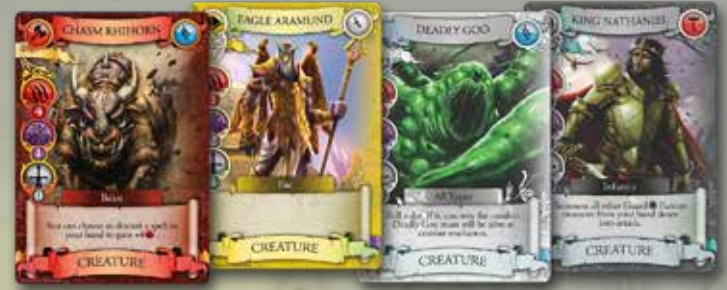
222 Creature Cards