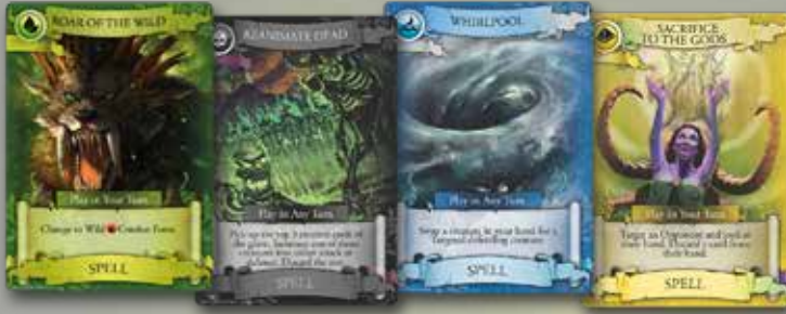
104 Spell Cards