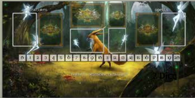
1 Game Board