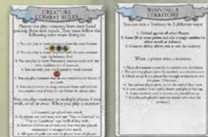
6 Double Sided Reference Cards