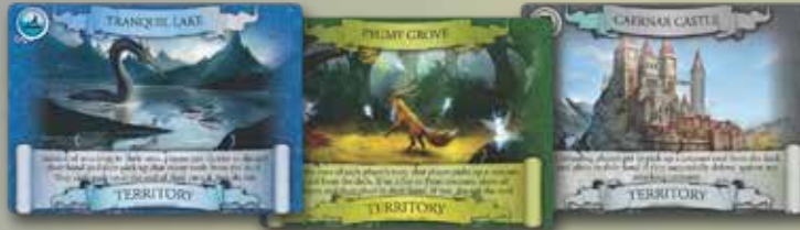
24 Territory Cards